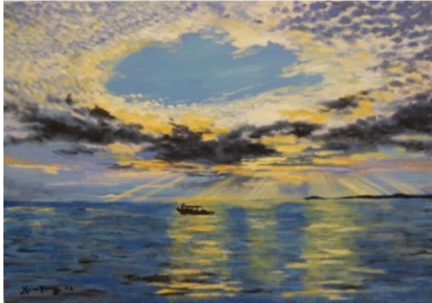
“New Beginning” Oil on canvas 39 x 55 cm by Ho Sou Ping