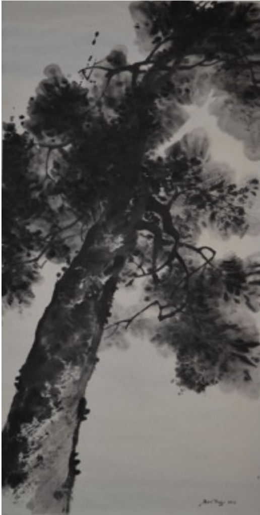
“Growth” Chinese ink on paper 139 x 70 cm by Ho Sou Ping

Rate of Return starts from deal structuring