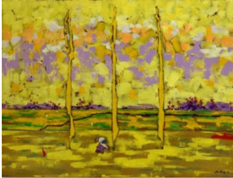
“Symphony of Yellow” Oil on canvas 90 x 119 cm by Ho Sou Ping